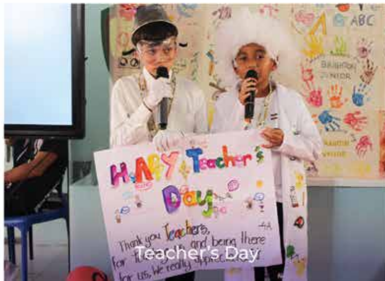
HAPPY Teacher's Day Thank you Teachers for being there for us, we really appreciate you.