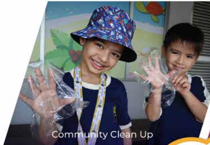
Community Clean Up