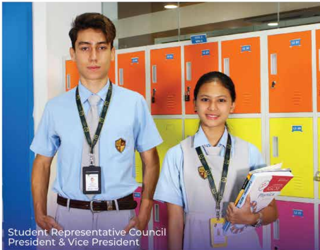
Student Representative Council President & Vice President

BIS is dedicated to preparing students for the challenges of both life and career by offering a comprehensive education that focuses on foundational literacy skills, liberal arts, and sciences. The school aims to equip students with the necessary competencies to thrive in a rapidly changing world while maintaining the high-quality education standards of previous generations.