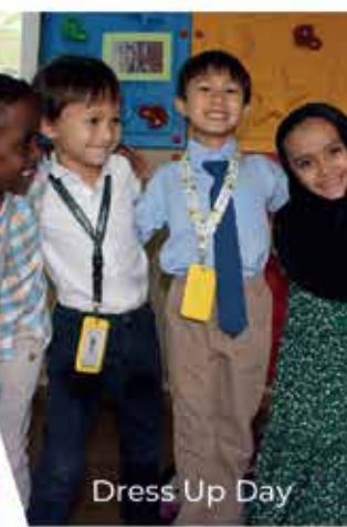
Dress Up Day