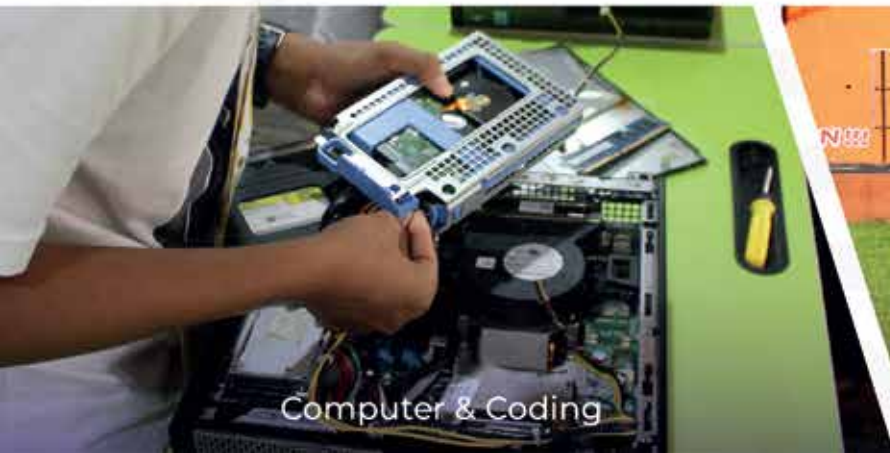
Computer & Coding