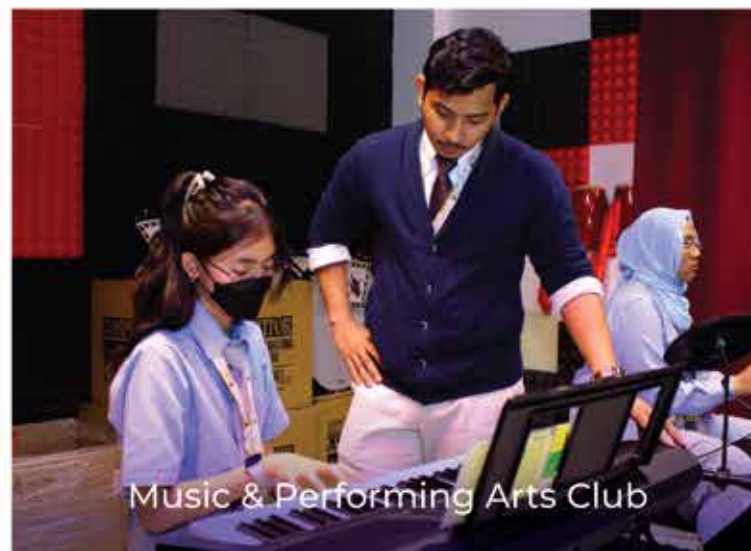
Music & Performing Arts Club