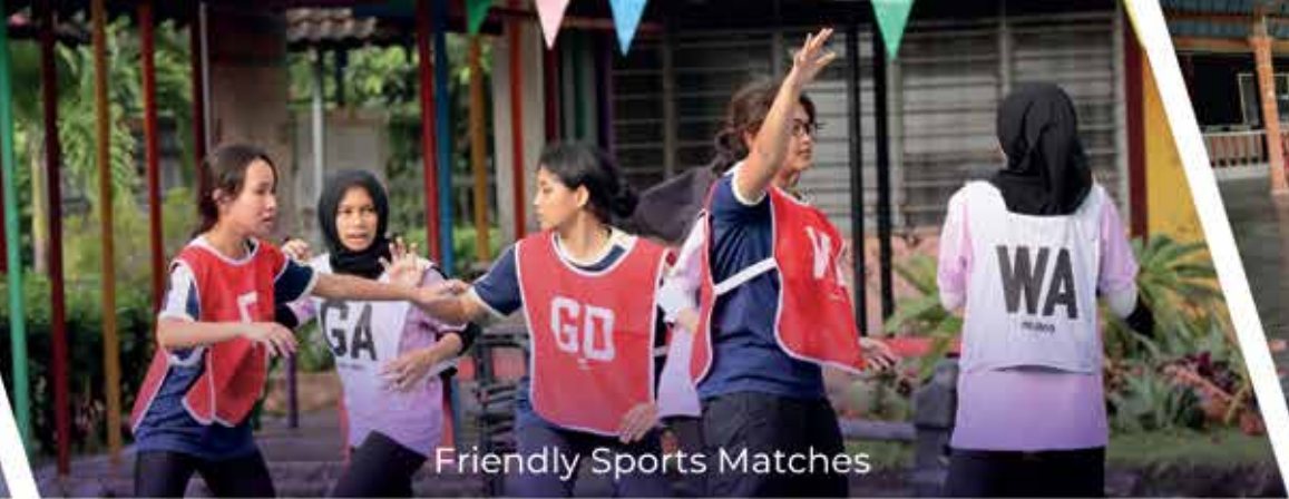
Friendly Sports Matches