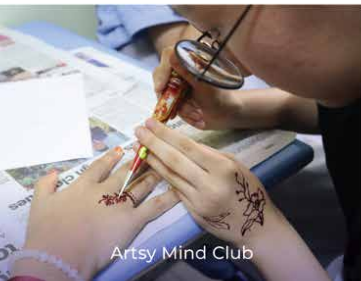
Artsy Mind Club