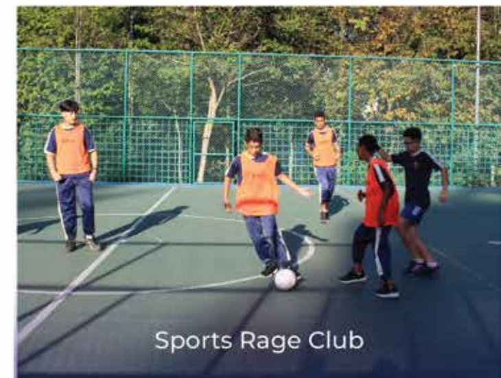
Sports Rage Club