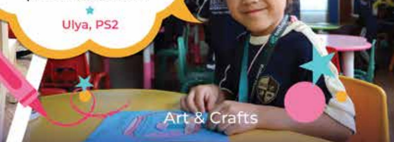
Art & Crafts