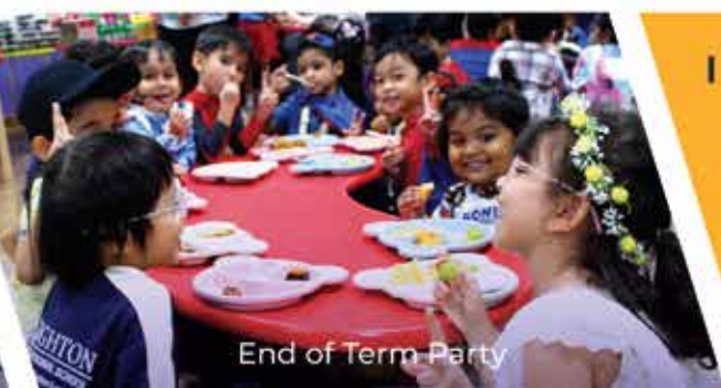
End of Term Party

I enjoy being a student at BIS because my teachers are caring and make sure that everyone feels welcome to learn.