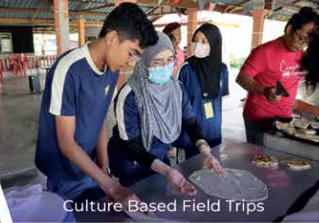
Culture Based Field Trips