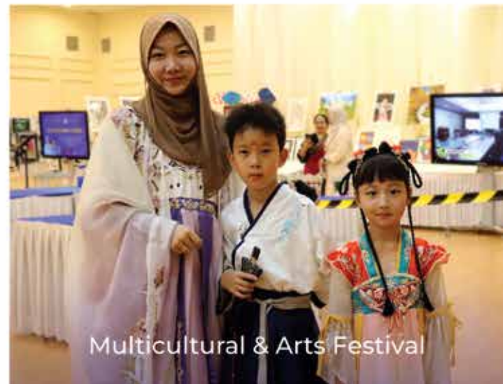
Multicultural & Arts Festival