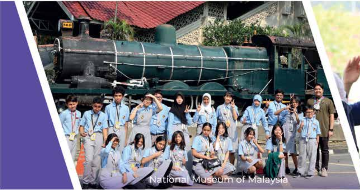
National Museum of Malaysia