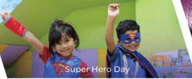
Super Hero Day