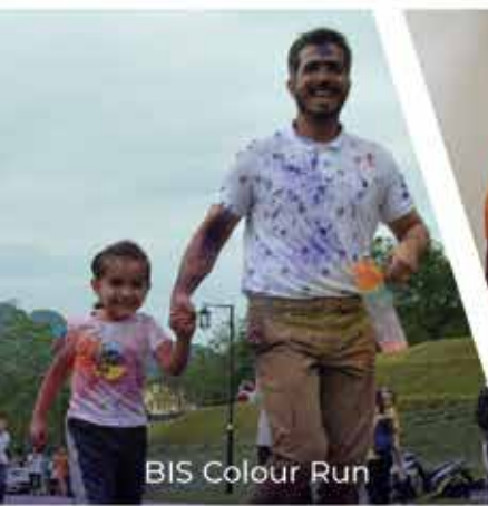
BIS Colour Run