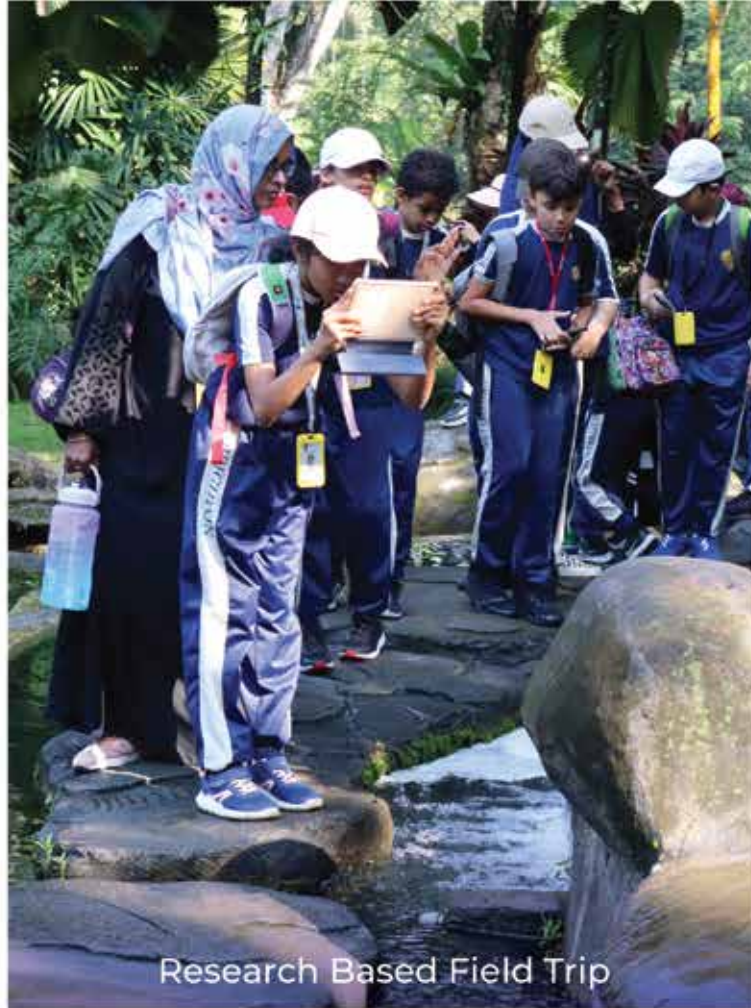
Research Based Field Trip