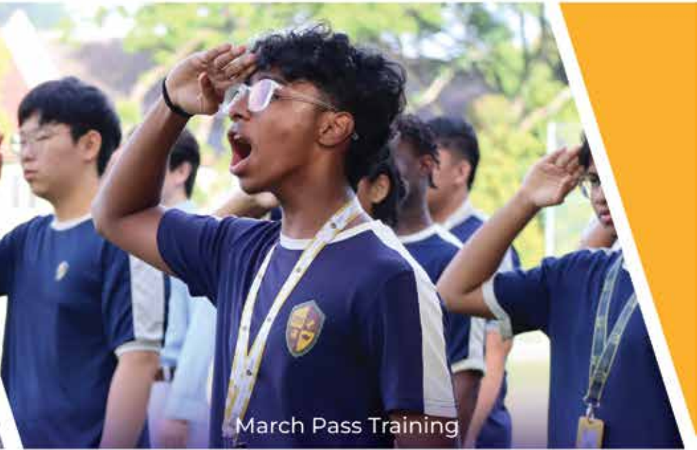
March Pass Training